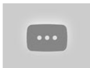
MOST CONTAGIOUS, L...